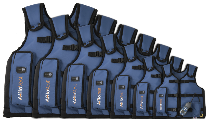
Patents Pending – USA & Worldwide